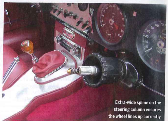
Extra-wide spline on the steering column ensures the wheel lines up correctly