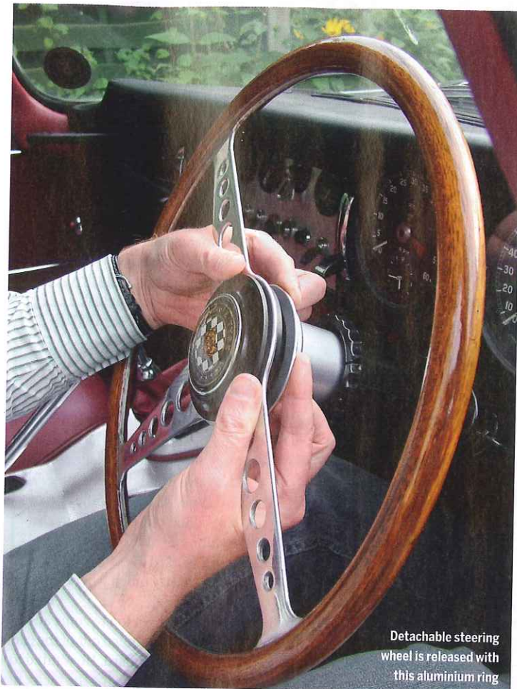
Detachable steering wheel is released with this aluminium ring